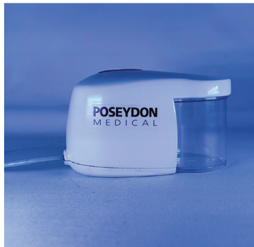
Oryon Aspiration Catheter & Smartpump - Poseydon Medical