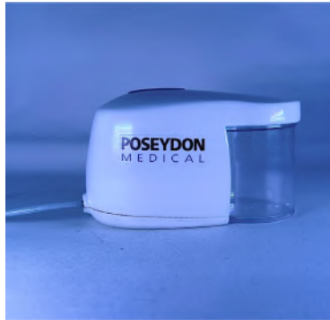
Oryon Aspiration Cateter & Smartpump - Poseydon Medical