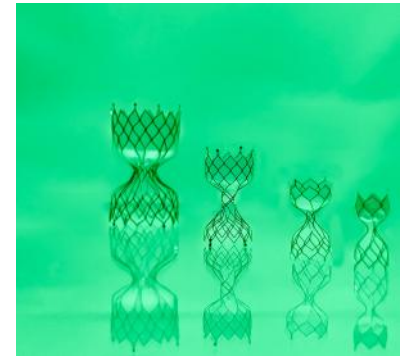
Hourglass Embolization Plug – EMBolic Acceleration